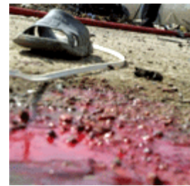
The aftermath of a Baghdad bomb attack - a study published in the Lancet estimates that 655,000 Iraqis have died as a result of the war.

Under the understanding, US forces have been instructed not to conduct aggressive military operations in Sadr City, Jaish al-Mahdi's stronghold, leading to accusations that a safe haven has been created for death squads.