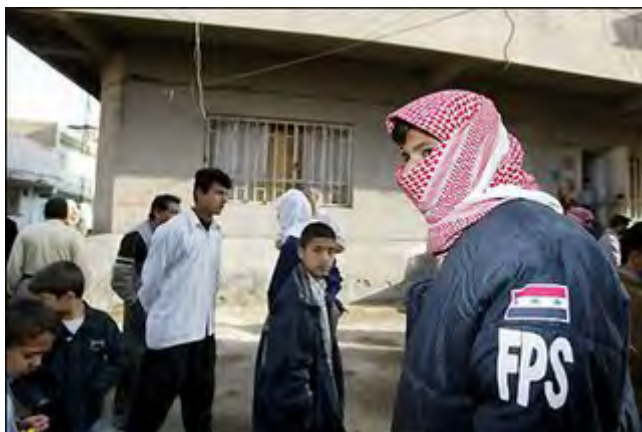
FPS in Samawa, Iraq.